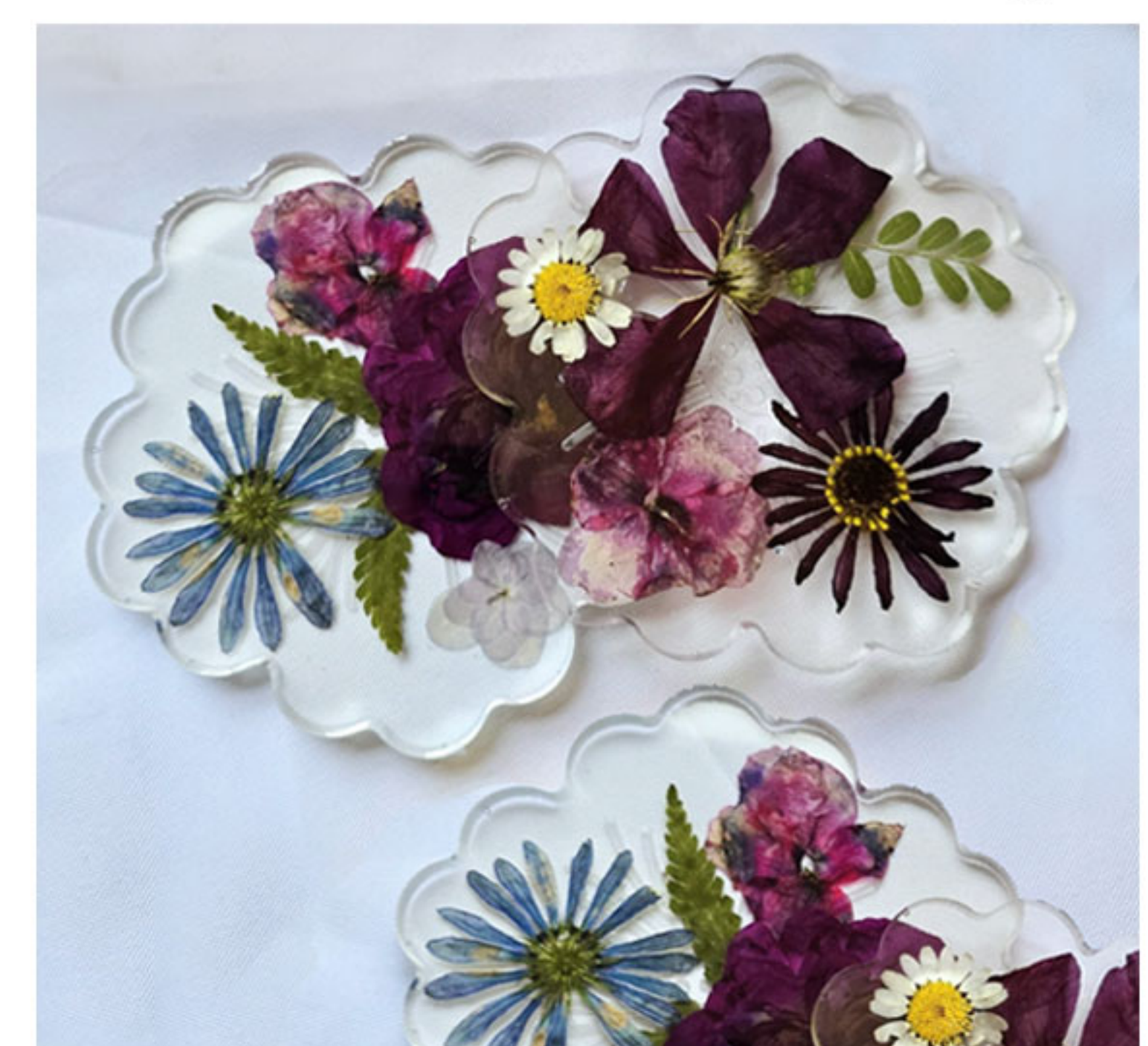
Coaster: 12cm diameter x 5mm depth