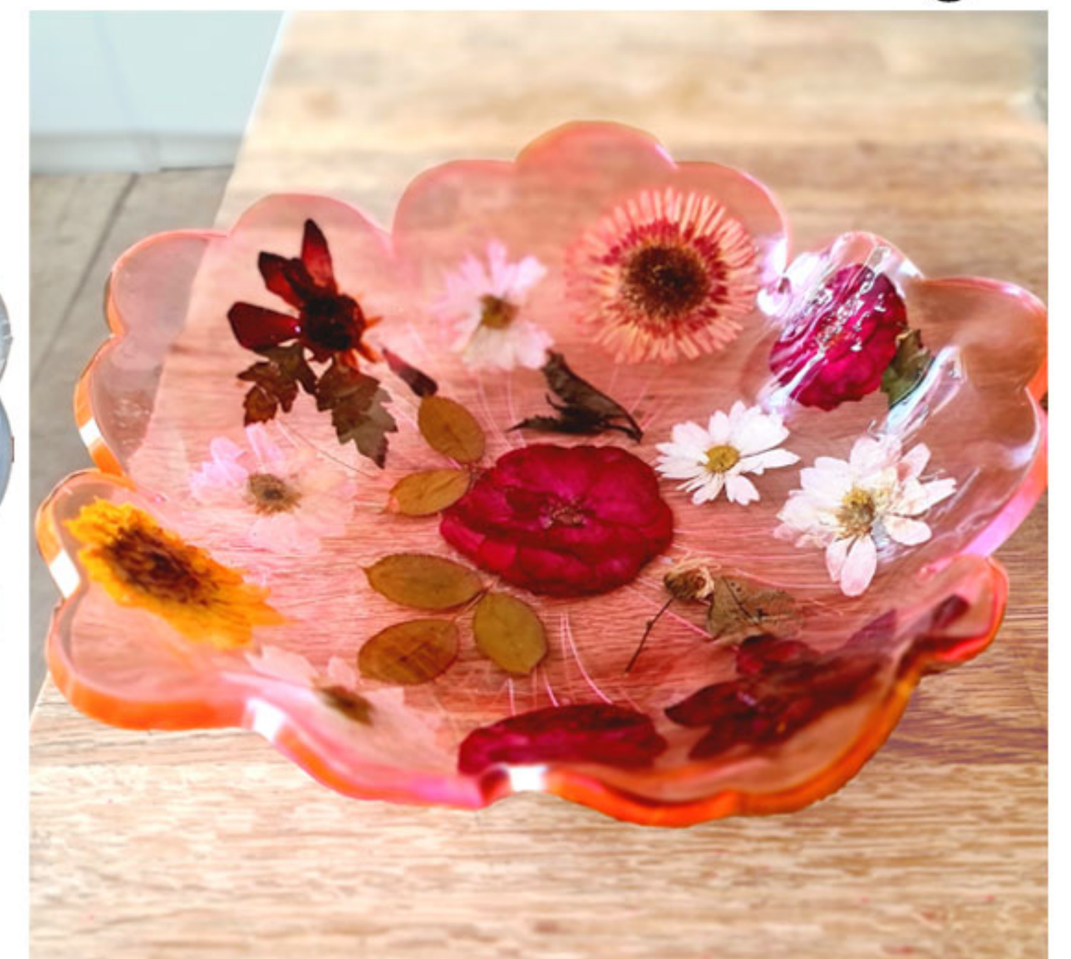
Bowls: 32cm diameter x 7cm depth