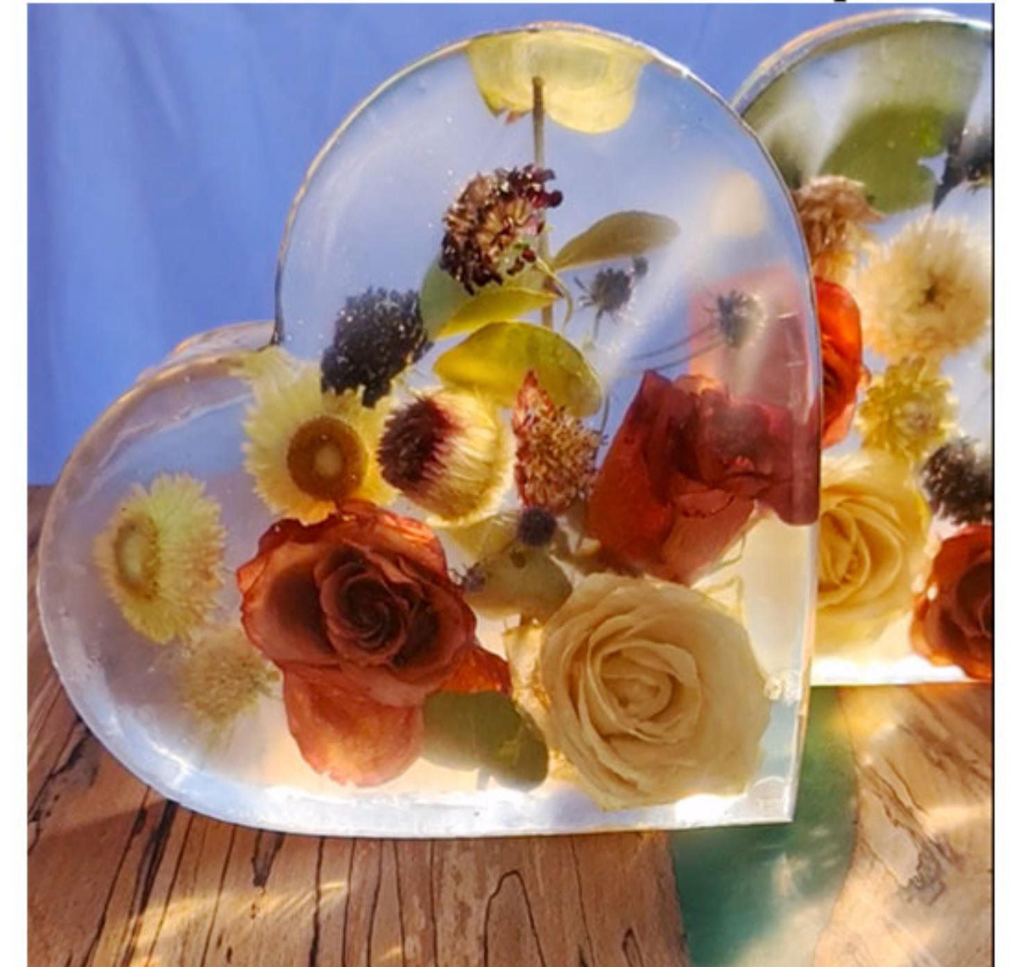
Heart block: 21cm height x 20 cm length x 5 cm depth

Perfect for medium and small size bouquets