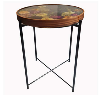
Tabletop: 40cm diameter x 4cm depth. Height with legs: 64cm