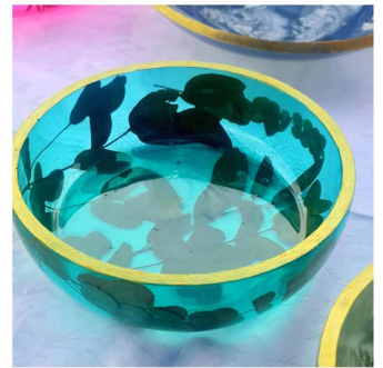
Bowls: 20.5cm diameter x 6cm depth

If your'e ordering other bouquet preservation products, consider adding a decorative bowl to your order. We can use leftover flowers and foliage from medium- and larger-sized bouquet tables / art pieces, to create one or more beautiful bowls. Not only does this help your flowers stretch further, but it also makes a gorgeous table centre-piece, or a great gift!