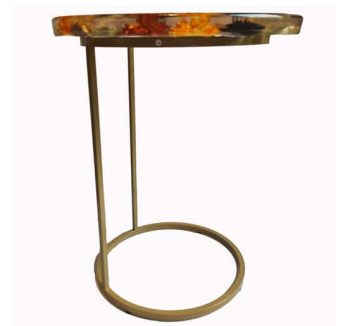
Tabletop: 50cm diameter x 4cm depth. Height with legs: 64cm