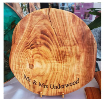
Cake stand / serving board: 35cm diameter x 6cm depth approx.

Add £15 for personalised laser engraved names