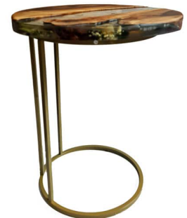
50cm diameter x 4cm depth. Height with legs: 64cm (if applicable)